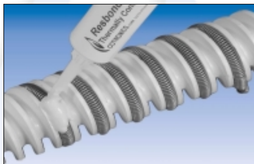
920 Provides a Thermally Conductive and Electrically Insulating Bond