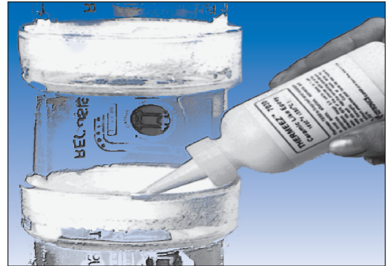
Thermeez 7030 Seals a Corrosion Resistant Exhaust System

Commonly used in high temperature exhaust systems, diesel engines, gas turbines, heating plants, etc.