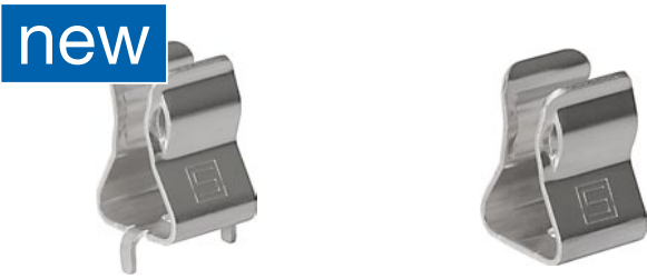
Solder THT version

Heavy Duty Fuse Clip, 10.3 x 38 /10.3 x 85 mm, 1500 VAC/VDC, 32 A