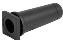
Cable Guard KT14 PVC Cable Guard for rewireable connectors