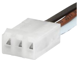
Wire Harness Wire harness for SCHURTER products