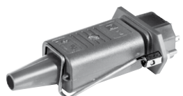
Cord retaining kits Cord retaining strain relief