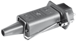
Cord retaining kits Cord retaining strain relief