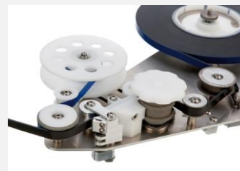
Liner Rewinding System